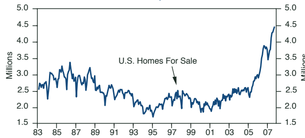
When the Offer Side of a Market Exceeds the Bid Side, Prices Fall