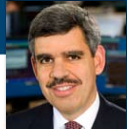
Mohamed El-Erian, CEO and CO-CIO

El-Erian: Dramatic transformations in growth drivers, wealth dynamics and institutional arrangements affect the ability of traditional investment approaches to generate sustainable returns while also managing risks. We have designed the PIMCO Global Advantage Bond Index as a tool designed to better represent the universe of investment opportunities available to investors in this new world. This means less emphasis on government debt of the United States and other industrialized countries, and more emphasis on the full spectrum of global